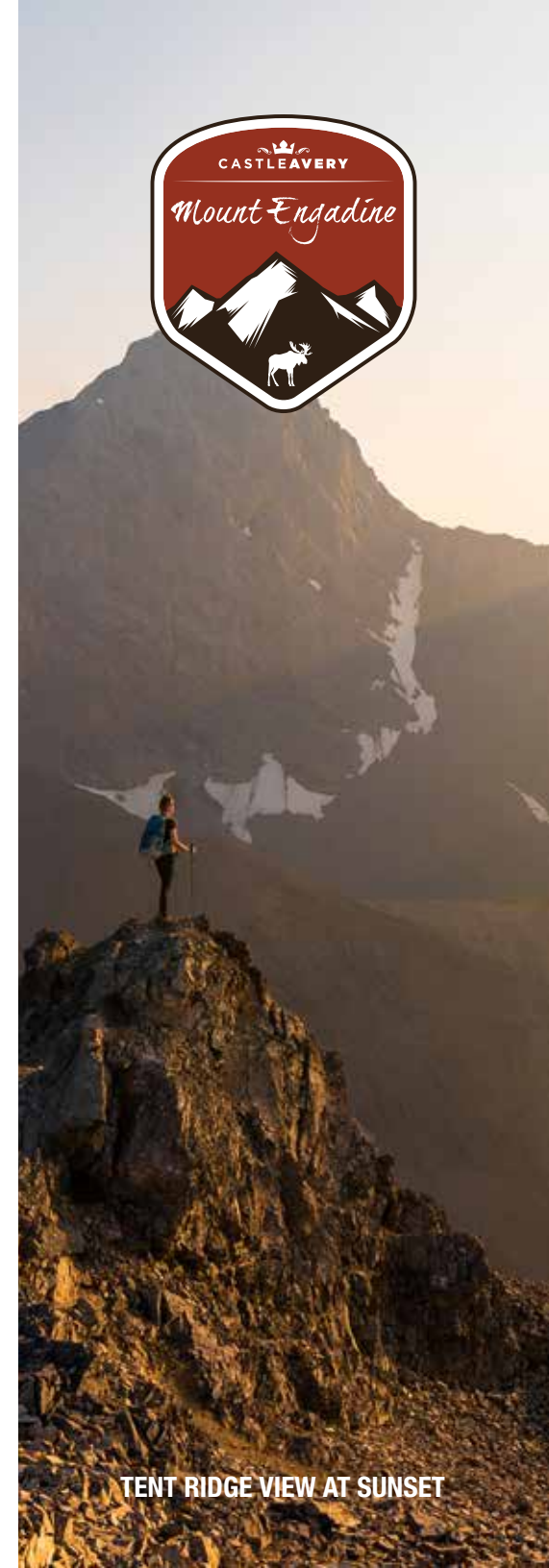
TENT RIDGE VIEW AT SUNSET